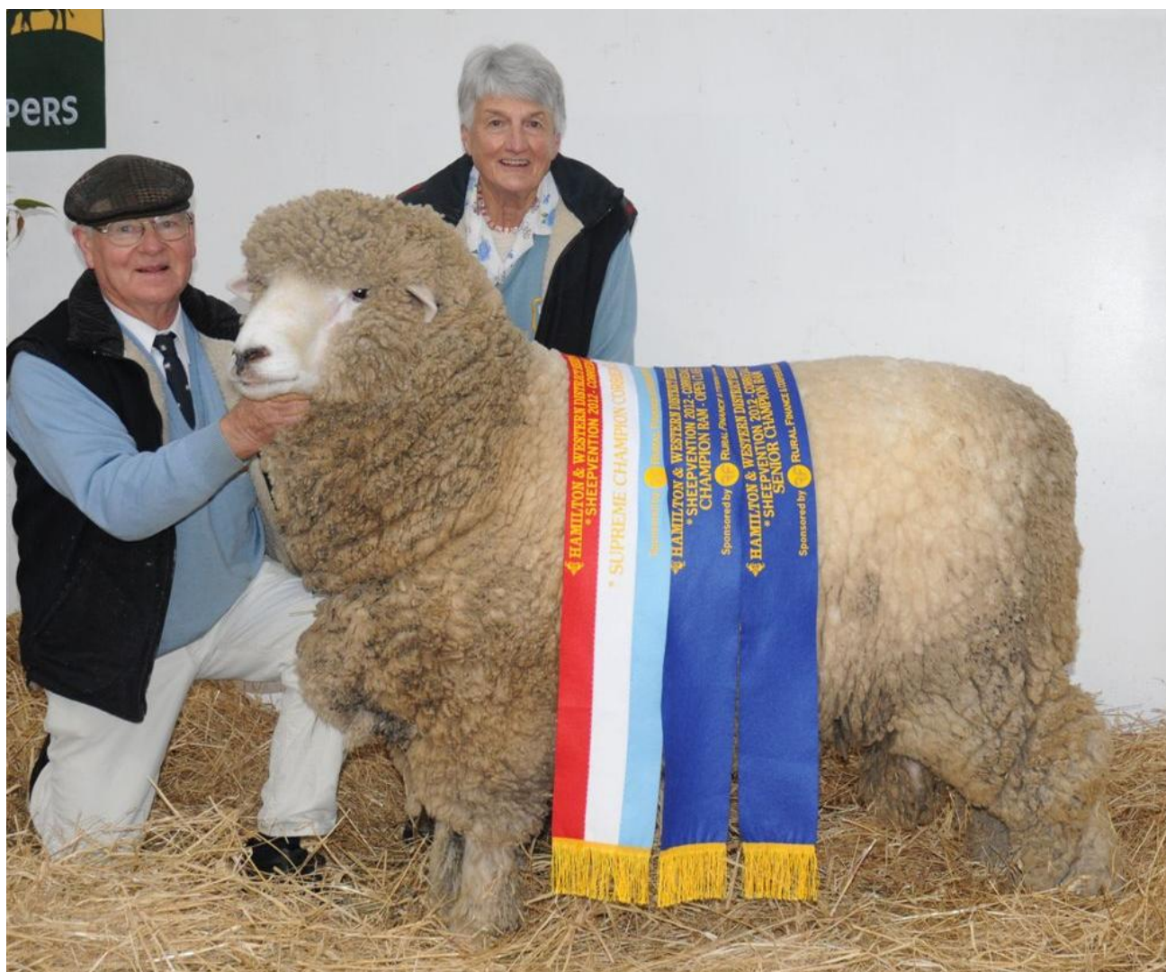
Liberton supreme champion ram at the 2012 Hamilton Sheepvention.

Supreme interbreed longwool group 2 nd Sweetfield