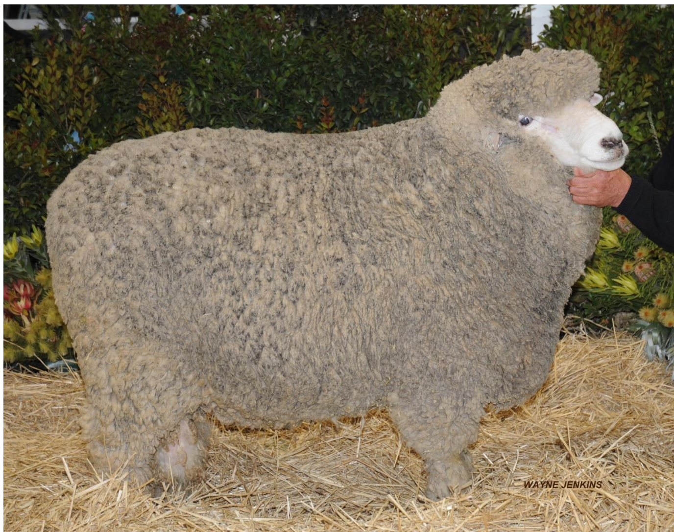
Quamby Plains supreme champion Corriedale, 2012 Australian Sheep and Wool Show, Bendigo.