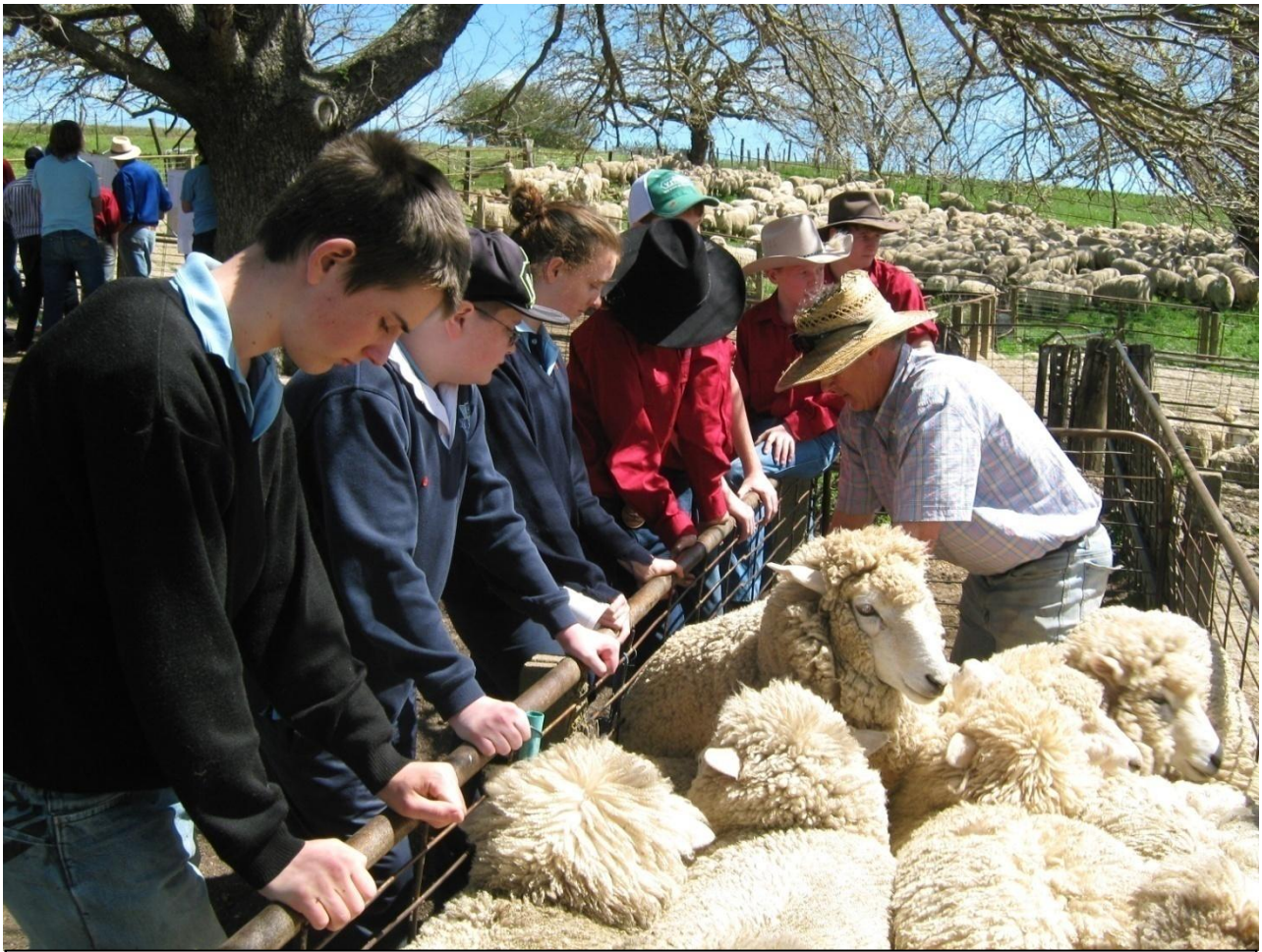
Successful field day at Gundowringa.

previously picked out. They found that sheep and many of the other top sheep in very quick time, in a hands-on, realistic, classing exercise.